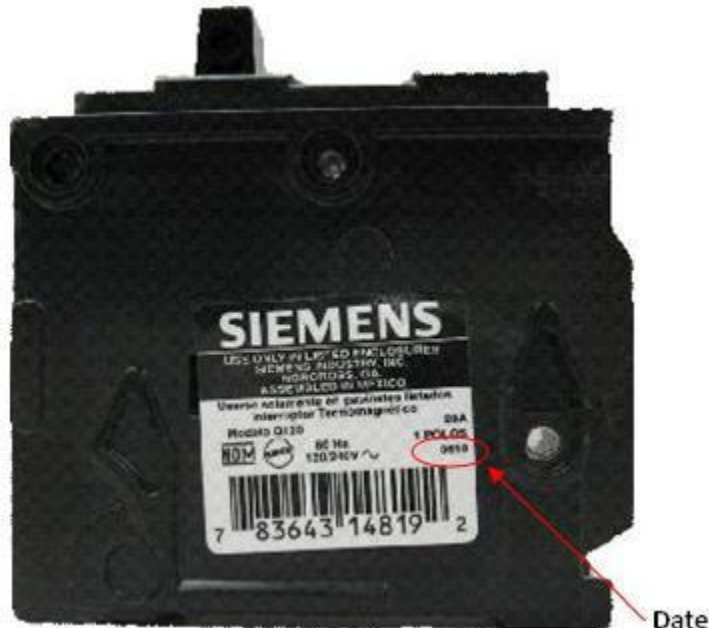
Circuit Breaker (side view)