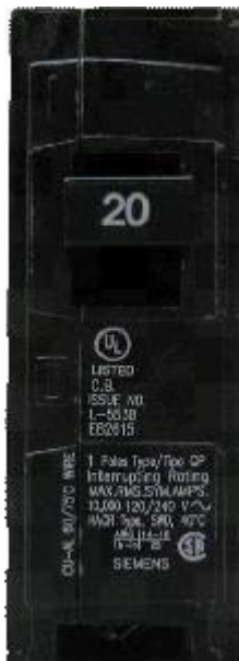
Circuit Breaker (front view)

Consumer Contact: For additional information, contact Siemens at (800) 756-6996 between 9 a.m. and 5 p.m. ET Monday through Friday or visit the firm’s website at www.usa.siemens.com